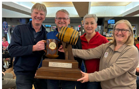
Day of the Dead - The Champions

The Winter Classic came in like a Bull ! The theme was Mexican Day of the Dead. Along with some curling teams participated in “Pin the Eyebrow on Frida”, the Sombrero Dance and Tequila Tasting.